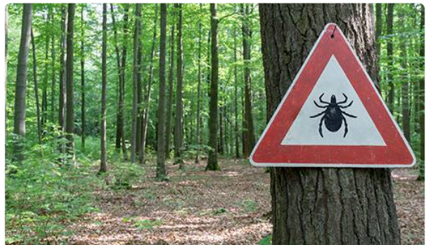
Maladie de Lyme